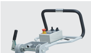
Tools for any application